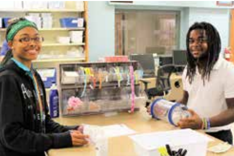
High School students gaining valuable work experience

United Ability's Employment Services Program offers adults with a wide range of physical and cognitive disabilities individualized job placement and support within competitive employment sites. At United Ability, we envision disability as an everyday part of the human experience, and we are committed to making this vision a reality. Our goal is to help both employers and individuals with disabilities acquire and maintain a beneficial relationship. Employment brings both a sense of pride and accomplishment. With your help, our supported employment team helped 1,225 adults, a 20% increase over our 2018 total , learn job readiness skills and find or maintain MEANINGFUL employment.