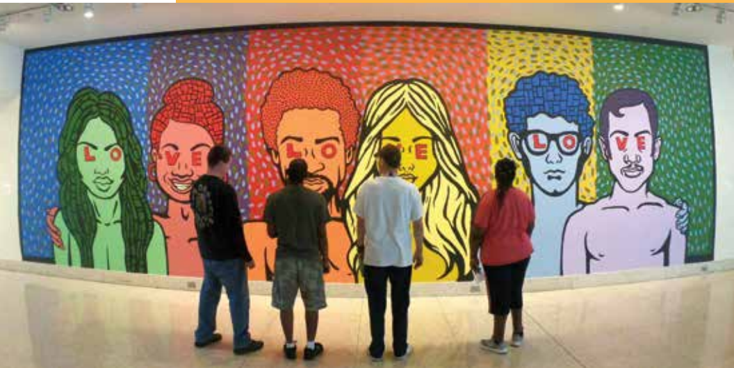
above: The adults from LINCPoinT enjoying and learning about art and culture

LINCPoinT's Adult Day program provides a variety of experiences and services that promote independence, work skills, and community involvement to individuals with a wide range of disabilities age 21 and over. Our dedicated staff strives to give the 174 program participants the best day of their life every day by offering enrichment activities, socialization, speech therapy, occupational and physical therapy, nursing and medical services, art programs, community outings, and vocational training. The socialization and family atmosphere brings joy and smiles to all. Because of YOU the adults took part in 1,134 community outings to places like the Birmingham Museum of Art helping to foster independence and community integration.